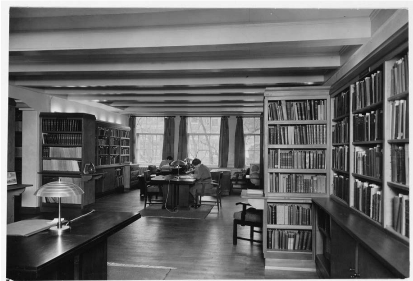
Economic History Library, Amsterdam. View of reading room on the first floor, ca. January 21, 1933.

Some of the more impressive acquisitions – such as a tulip book 8 (early seventeenth century), Japanese prints (early nineteenth century), coins and medals and price lists – were made possible partly by members making extra payments into the Book Fund, which had been established in 1927. 9 This Book Fund could be regarded as the result of a type of crowd funding (before the term existed).